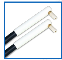
90° non-rotating output cable pin adapters