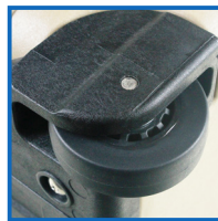
Heavy-duty polyurethane wheels with stainless steel bearings

Our 240V processor is capable of fusing all sizes of electrofusion fittings at voltages ranging from 8 to 48 volts, while our 120V processor is capable of fusing fittings up to 24" at voltages ranging from 8 to 48 volts.