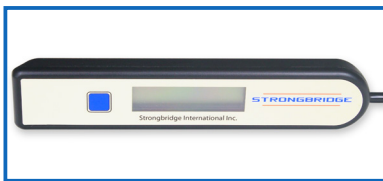
SmartScan barcode scanner