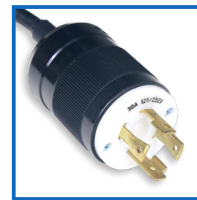
Industrial grade NEMA locking plug