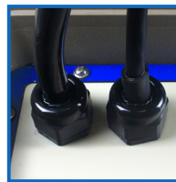
Gasket sealed 12 ft (3.7m) input and output cables